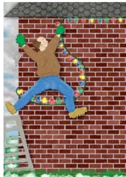
Hanging Christmas Lights

Hanging Christmas lights like a pro can be accomplished by anyone, regardless of skill level and experience. With the proper tools and steps, any beginner can successfully light up the exterior of a home.