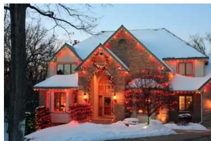
House Decorated with Christmas Lights

Use our Christmas Light Clips Guide to find the best clip for your applications.