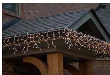
Hanging Icicle Lights

Begin by studying the roofline, gutters, and shingles. Christmas lights can be installed on any of these surfaces, but there are specific clips for each type of surface. Inspect how thick the gutter lip is, and how loose or tight the shingles on the roof are. Do the gutters get in the way of the shingles?