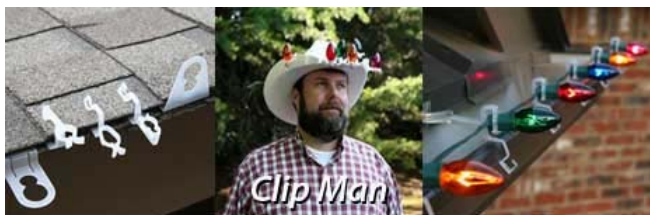
Install Lights Like a Professional with Christmas Light Clips

Hang your Christmas lights like a pro this year! Our selection in top quality LED Christmas lights have caught the attention of Fox News, CNN, HGTV, CBS and more. Now you can buy your Christmas lights where the pros buy theirs, and hang the best Christmas lights in town! Take advantage of the installation secrets our sales team has learned from years of working with commercial lighting professionals.