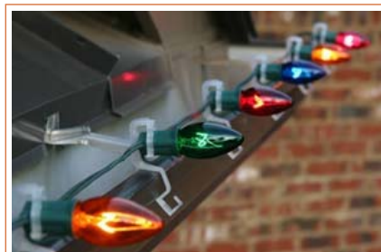
Christmas Lights Installed on Gutters with Omni All-in-One Clips

Hanging Christmas Lights | Christmas Light Clip Guide | Christmas Light Clips Chart