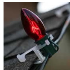
All-in-One Light Clip