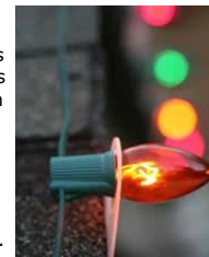
Original Shingle Tab with C9 Bulb