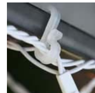
"S" Style Gutter Hook