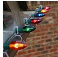
C7 Christmas Lights Hanging on Gutter

The final step in hanging Christmas lights is to turn the power on and admire the view. Look for any bulbs that may not be lit, and ensure they are screwed in tightly, replacing if necessary. Set an outdoor timer to turn the lights on daily at dusk, and either turn off at midnight (a popular time), or the next morning. Most timers shut outdoor lights between 11pm and midnight to save on energy, yet stay on late enough for everyone who drives by to enjoy. Don't forget to take pictures and email customerservice (at) ChristmasLightsEtc.com so we can enjoy and post as well!